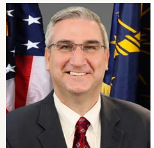
Eric Holcomb Governor of Indiana